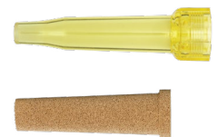
Nozzle and filter sold separately